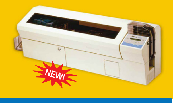
P720 Dual Sided Color with Dual Laminator

For dual sided laminated card applications, the Eltron P720 is the fastest, most economical laminating card printer available. Its unique dual roll laminating system applies near edge linerless laminating patches to both sides of the card simultaneously, in a single pass. This means fast production of highly durable cards protected by laminate patches on both sides. The P720 linerless laminate material is more economical than traditional laminate patches, and because there's no liner/carrier, the P720 can laminate up to 800 cards without replacing laminate rolls.